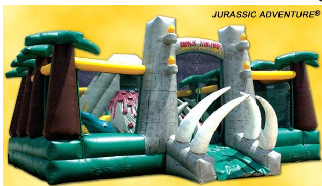
Lost Ark giant Inflatable Fun Factory