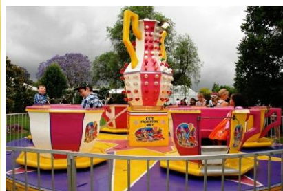
Cup and Saucer